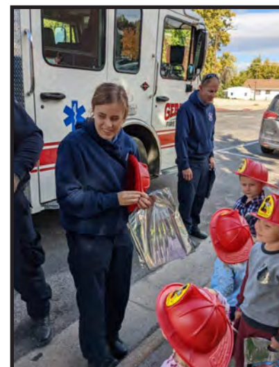
Gering Fire Department volunteers talk to students about fire safety during Fire Prevention Month in October.

Libraries store the energy that fuels the imagination. They open up windows to the world and inspire us to explore and achieve, and contribute to improving our quality of life. Libraries change lives for the better. — Sidney Sheldon