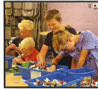
Kids enjoying Lego Club after school at the Gering Public Library